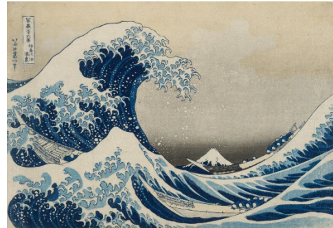
Under the wave off Kanagawa ('The Great Wave'), from Thirty-six Views of Mt Fuji , late 1831. Color woodblock print. Japan. 2008,3008.1JA Acquired with the assistance of Art Fund and a contribution from the Brooke Sewell Bequest.

Katsushika Hokusai (1760-1849) secured his place in history with the creation of The Great Wave , originally featured in his acclaimed series, Thirty-six Views of Mount Fuji . This seminal artwork captures the eternal harmony between man and nature, serving as the focal point for an enchanting exploration into Hokusai's extensive body of work comprising an estimated 30,000 prints spanning his illustrious 70-year career.