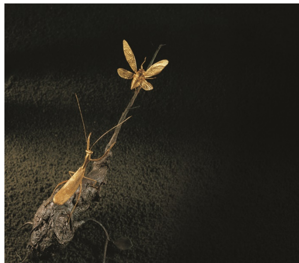
Mantis Capturing Cicada, 1995 © Wu Ching

The Bowers Museum was honored to have an array of esteemed supporters in attendance including