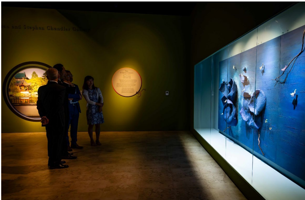
Visitors explore 30-foot-wide polyptych inside The Eternal Garden Exhibition

Santa Ana, CA (February 24, 2025) – The Bowers Museum is excited to participate in SoCal Museums' annual Free-For-All day on Sunday, March 16, 2025 , offering free General Admission—including full access to The Eternal Garden: Titanium Art by Aka Chen .