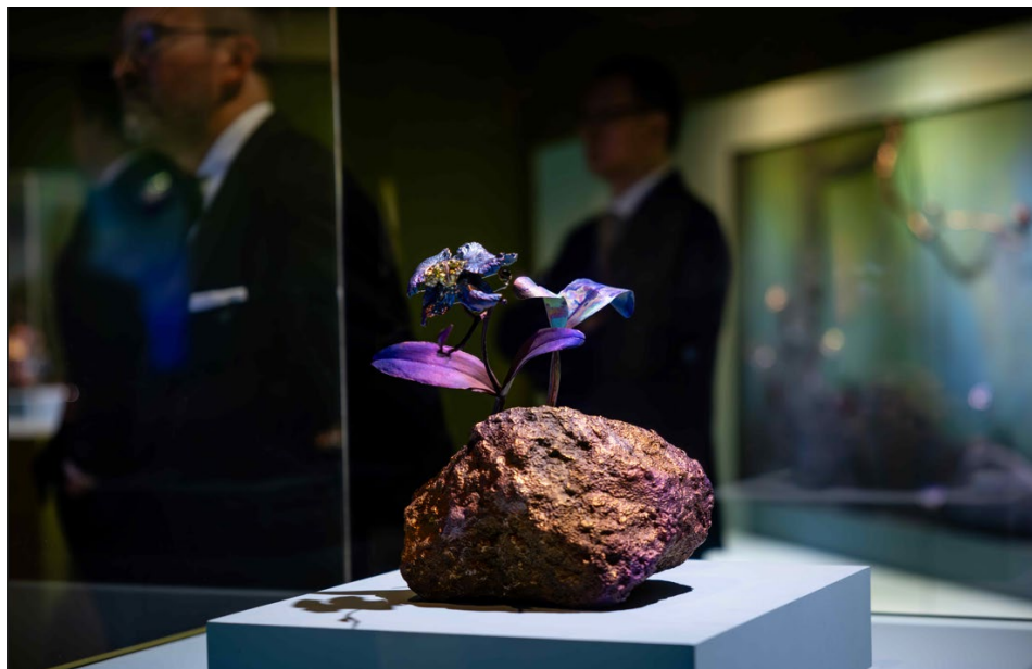
Installation shot of one of more than 20 sculptures on view

In addition to The Eternal Garden , visitors can explore eight other exhibitions from around the globe, from Art of the Pacific to Ceramics of Western Mexico and more, at Bowers Museum for free during SoCal Museums' Free-for-All.