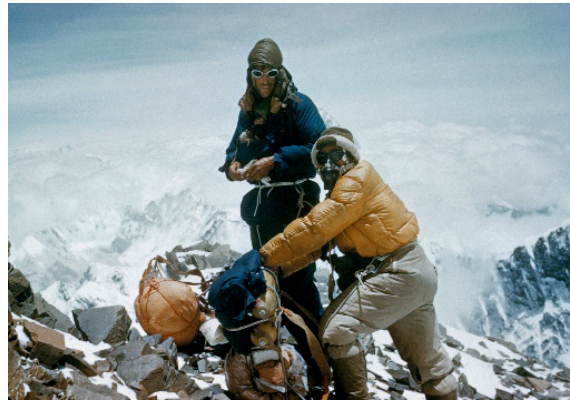
Image Left: Edmund Hillary and Tenzing Norgay, 1953

On the heels of the centennial of the first British reconnaissance expedition to Mount Everest (1921-2021), this holistic exhibition curated by Wade Davis, the award-winning author of Into the Silence: The Great War, Mallory and the Conquest of Everest , explores the history, resolute characters, unsung heroes – including Tibetan and Nepalese Sherpas – and changing technologies of the initial attempts to climb the tallest mountain on earth.