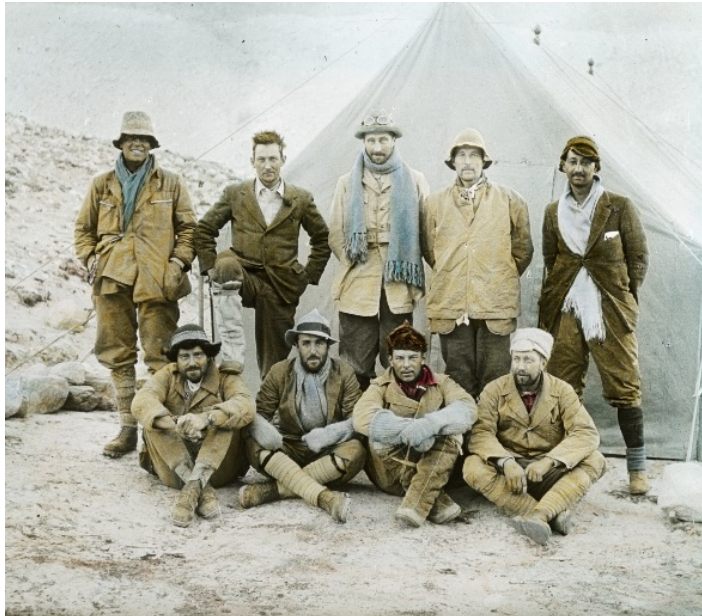
The 1924 Mount Everest Expedition in camp